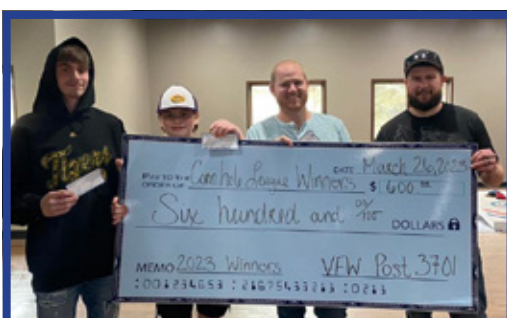
1st & 2nd place winners of Post 3701's fourth annual winter cornhole league

Scan the code below to keep up with us, enter raffles and join in on the fun!